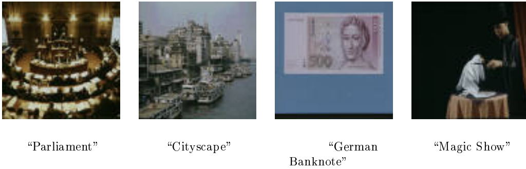
Figure 1: Sample images from the Viper test database.

Negative feedback was not employed in this experiment. This set of relevant images was then submitted as a second query.